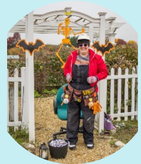
Ready for the onslaught